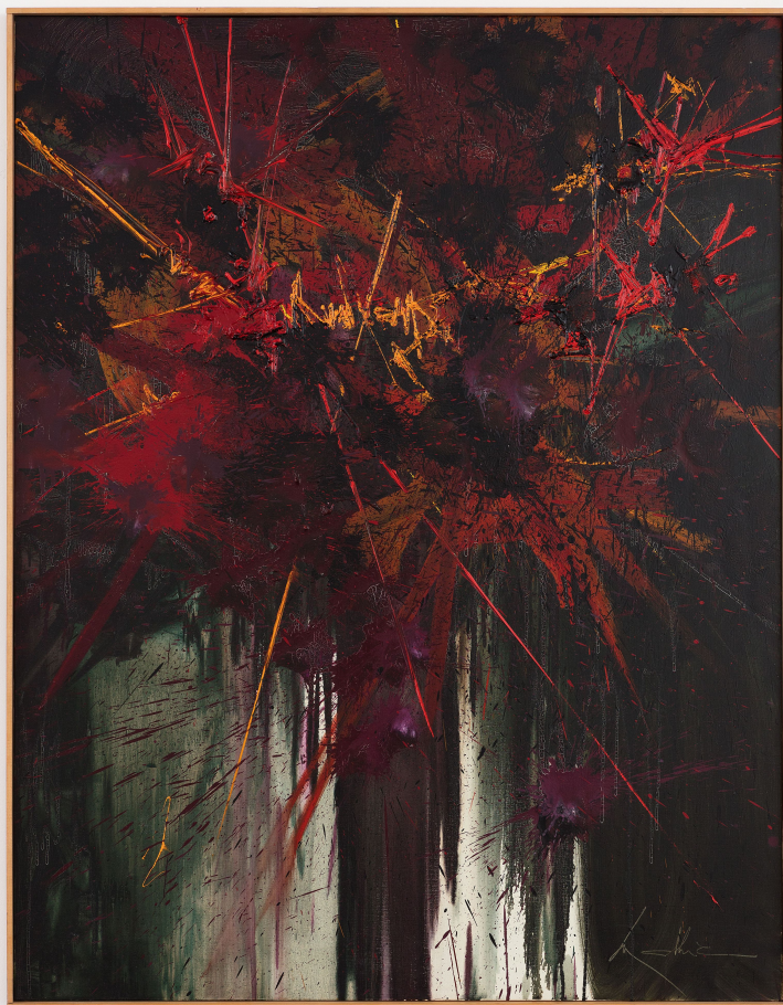
Georges Mathieu Plenitudes insensées (Senseless Plenitude) , circa 1980. Oil on canvas. 146 × 114 cm | 57 1/2 × 44 7/8 in.

© Georges Mathieu / ADAGP, Paris, 2019. Courtesy of the artist & Perrotin.