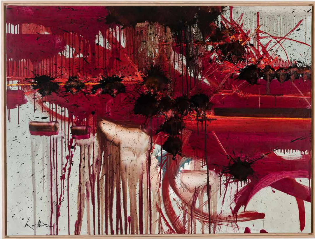
Georges Mathieu Vision révolue (Bygone Vision) , 1990. Oil on canvas. 97 x 130 cm | 38 3 / 16 x 51 3 / 16 in. © Georges Mathieu / ADAGP, Paris, 2019. Courtesy of the artist & Perrotin.