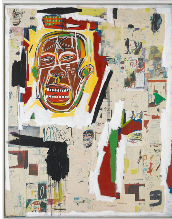
Jean-Michel Basquiat, King of the Zulus (1984–85). Marseille Museum of Contemporary Art.