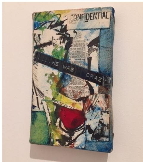
Jean-Michel Basquiat, He Was Crazy (1979).

Several of these diminutive works are displayed in a double-sided glass case that allow the viewer to see the "© Jean-Michel Basquiat" tag scrawled on the back. A standout of these small earlier works is a 1979 canvas with swaths of blue color, newspaper clippings, and a strip of diagonal black label tape that reads "He Was Crazy," which is also the title of the work.