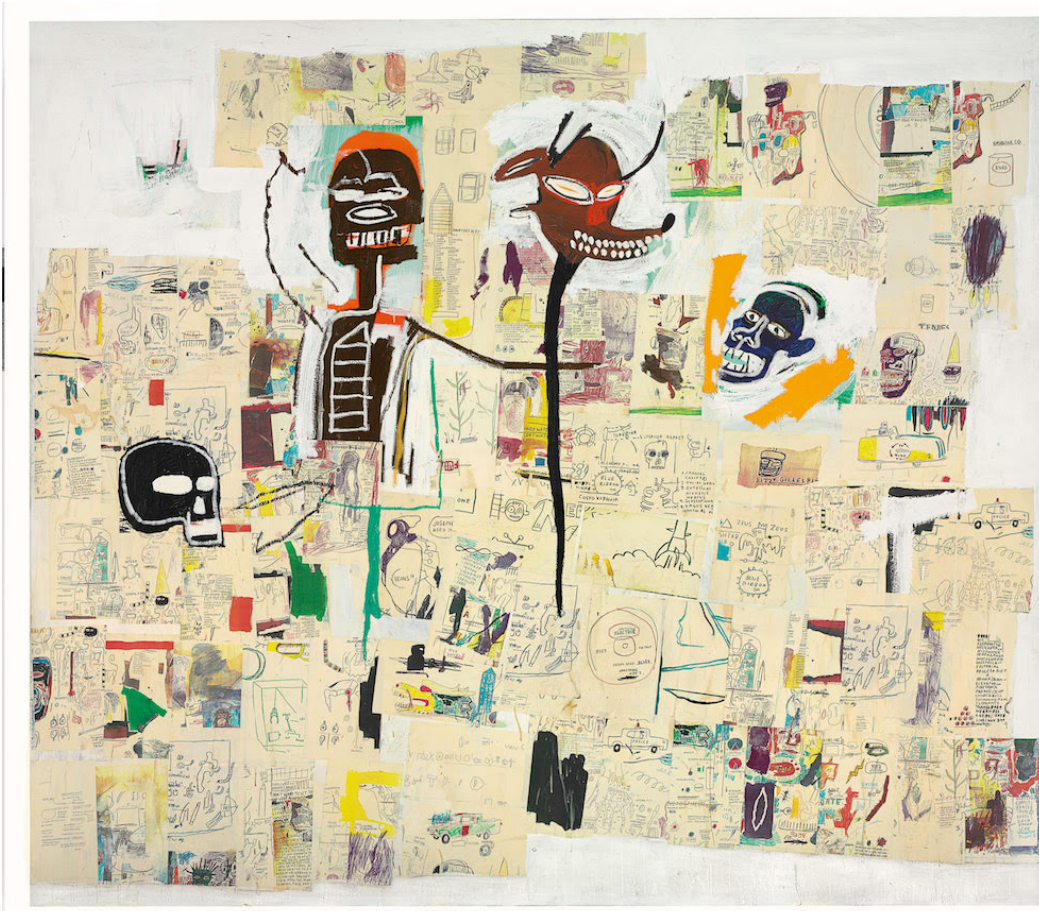
Jean-Michel Basquiat, Peter and the Wolf (1985).