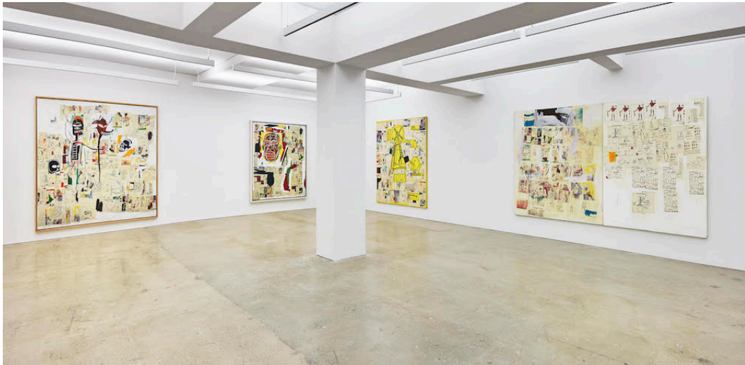
© Estate of Jean-Michel Basquiat. Licensed by Artestar, New York.

The works at Nahmad Contemporary range in date from 1979 through 1987 (the year before Basquiat's death) and reflect the artist's playfulness and penchant for experimentation. It opens with Basquiat's first foray into the xerox medium, when he and his friend Jennifer Stein created a small series of colorful collages by incorporating photocopies of paint splatters, scrawled text, and detritus, including candy wrappers and newspaper clippings, into postcards that they then sold on the street.