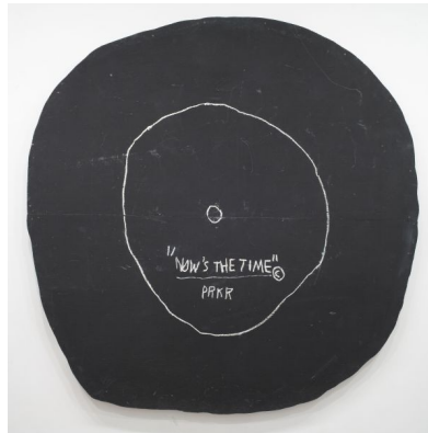
Jean-Michel Basquiat, Now's the Time, 1985.

In an era of test-marketed content and outreach surveys, it's perhaps not surprising that something as intimate and personal as poetry has come back into fashion. The wild popularity of poets like Eileen Myles and Claudia Rankine these days is testament to that.