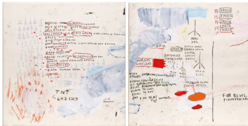
Jean-Michel Basquiat, Eroica I and II, 1988.

Alongside contemporary musicians, young poets like Greg Tate (who contributed a piece to the exhibition catalogue) cite Basquiat as an influence as important as any traditional poet, and his impact on young painters is far too immense to cover here. That being said, we wouldn't have artists as varied as Rashid Johnson and KAWS without the legacy of Basquiat.