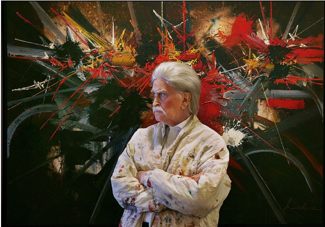
The late French artist Georges Mathieu at his home during a photo shoot on October 1, 2007 in Paris, France.

The market for work by the late abstract painter Georges Mathieu has been on a remarkable rise and fall and rise again since he first emerged in France in the postwar years, a period in which he has been alternately celebrated and sidelined.