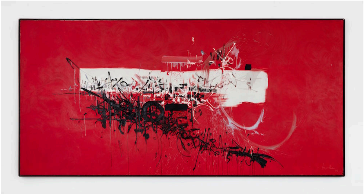
Georges Mathieu, Hugues de Payens fonde l'ordre du Temple (1958).

In the 1960s, Mathieu's high-profile commissions included a tapestry that was shown at the French pavilion at Expo 67 in Montreal, a set of dinnerware for Sévres, a design for the 10-franc coin, a stamp commemorating Charles de Gaulle, and abstract designs for Air France advertising posters.