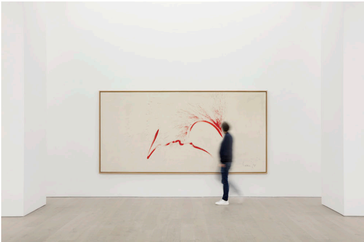
Installation view of Georges Mathieu at Perrotin New York, 2021.