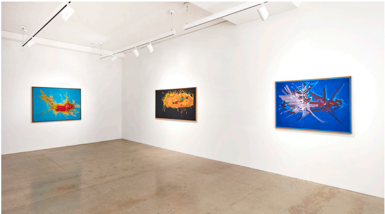
Installation view of Georges Mathieu at Nahmad Contemporary.