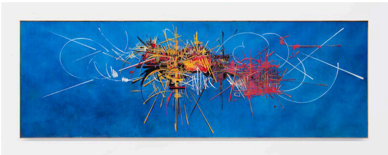
Georges Mathieu, Paris, Capital of the Arts (1965).

Mathieu is also one of the most frequently searched artist names in the Artnet Price Database. According to Artnet Analytics, there were 58 searches in August 2020, compared with 289 searches in July 2021, a nearly five-fold increase. (Readers can buy the full standard artist report with Artnet Analytics here .)