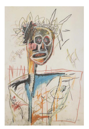
Jean-Michel Basquiat. Untitled . 1982. © The Estate of Jean-Michel Basquiat

SCHIELE I TWOMBLY | BASQUIAT May 2 – June 14, 2014