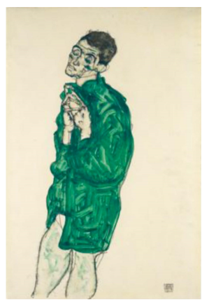
Egon Schiele. Self-Portrait in Green Shirt with Closed Eves. 1914

Nahmad Contemporary is pleased to announce its forthcoming exhibition, Poetics of the Gesture: Schiele, Twombly, Basquiat, the first ever to examine the similarities between three of the most influential twentieth century artists of their respective generations—Austrian expressionist Egon Schiele, American postwar artist Cy Twombly, and American neo-expressionist Jean-Michel Basquiat.